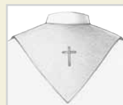
Fitted V Neckline