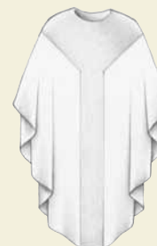
V Yoke and Panel