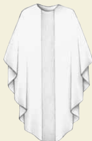
Single Panel Orphrey