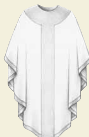
Round Yoke and Panel with Outer Edge