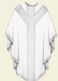
Y Pattern with Outer Edge