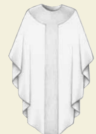
Round Yoke and Panel